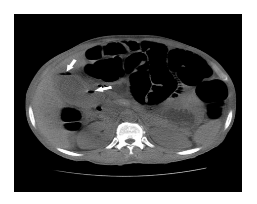
Figure 2: Abdominal CT scan showing air within the wall of the gallbladder

Angle: 0.0 Exmay 13 2016 DFOV: 14:2 cm Drmat) so acute 1.2mm 1.375:1/1.25sp 0.70/